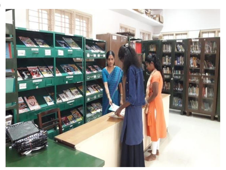
Books Issue Section