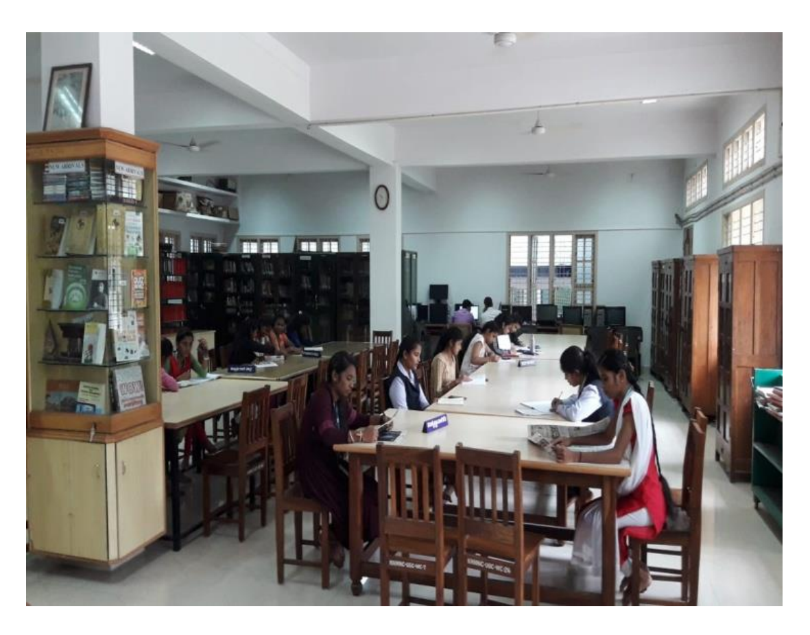
Faculty Reference Section